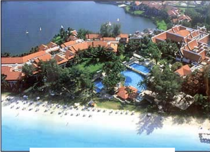
Laguna Beach Resort, Thailand

The Amari Coral Beach Resort in Patong was badly affected by the tsunami and will be closed until August because of repairs and renovations. Their position on the hillside leading into Patong beach took significant damage and they're using this time to make extensive repairs and renovations to their swanky resort.