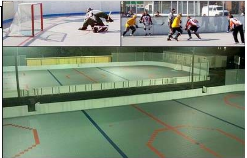
Top: Mateflex in action—Bottom: Welland complex

Manufacturing for such prestigious national and worldwide accounts as Parks and Recreation Asso-